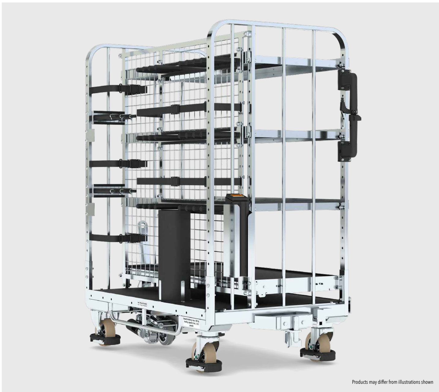
Products may differ from illustrations shown

This kitting trolley can be moved in a tugger train and provides electrical support for ergonomic work when moved by hand. This support can be utilized permanently or as a starting aid only. The powered castor is centrally located underneath the carriage and is raised when not in use in order to minimize wear.